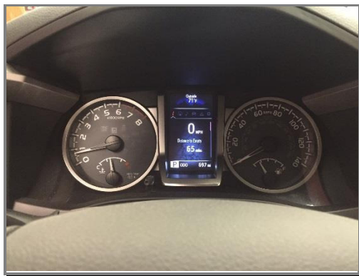
No MIL Illuminated

Considering the fact that a capable scan tool is the only way to identify some DTCs, Toyota requires that repairers perform a “Health Check” diagnostic scan if a vehicle has sustained damage as a result of a collision that may affect electrical systems. Additionally, Toyota strongly recommends that repairers perform a “Health Check” diagnostic scan before and after every repair to identify and document DTCs. If DTCs are identified pre-repair, then they can be considered to create a complete vehicle damage analysis report. If DTCs are identified post-repair, then they can be diagnosed and addressed before returning a vehicle to the customer.