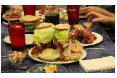
Don I wouldn't even think about it if I were you....