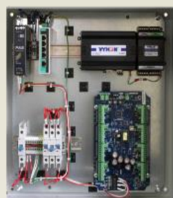
ReMASTER Data Collection System