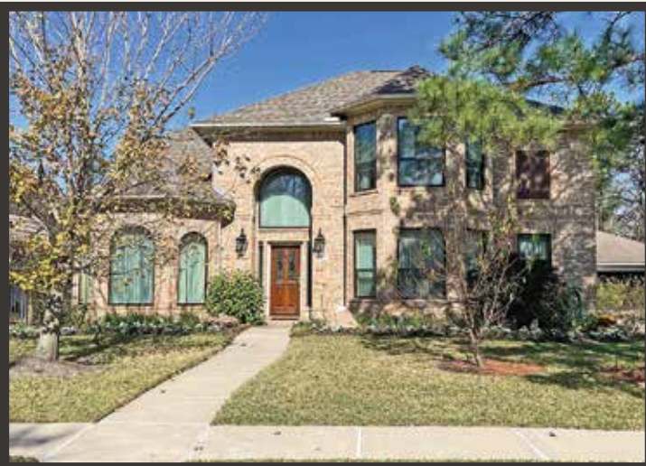
SECTION 1 7518 Allegro Dr