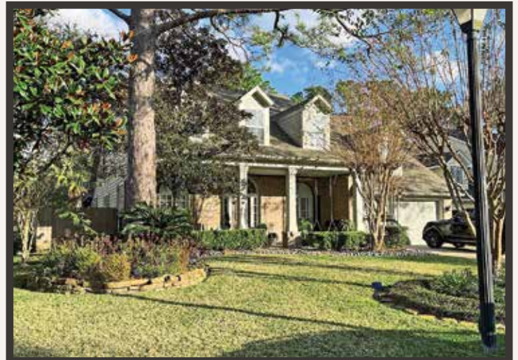
SECTION 4 8014 Chorale Ct