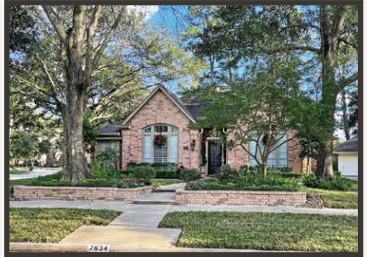
SECTION 2 7634 Rolling Rock St