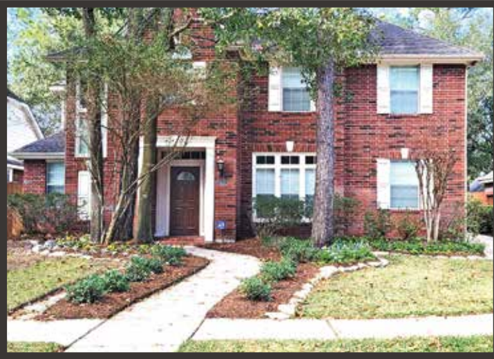
SECTION 1 9007 Ensemble Ct