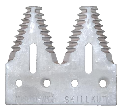
JD (600 SERIES) 8531SK2 $ 2.50 EA.