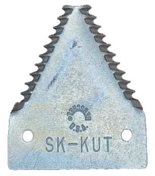
MAC DON 4398SK2 $ 1.70 EA.