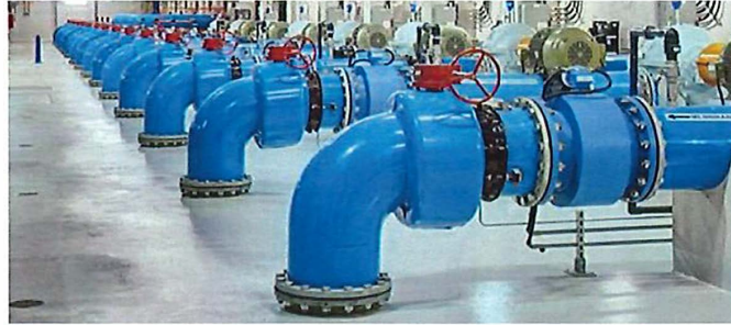
GWD Distribution System Testing