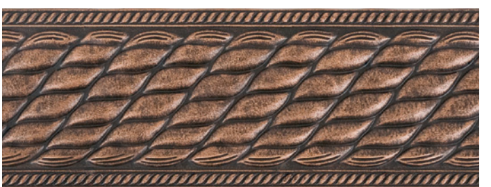
8073 Windblown SINGLE H 4" (Shown in Antique Copper) 8074 Windblown DOUBLE H 8"