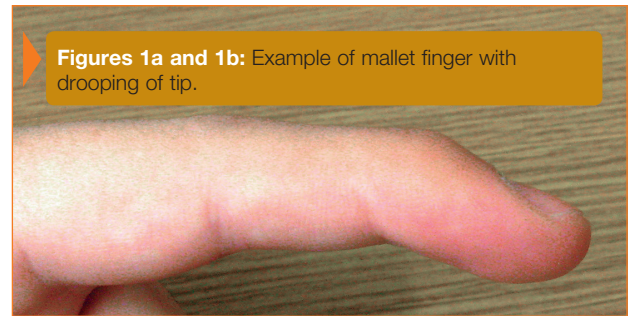
Figures 1a and 1b: Example of mallet finger with drooping of tip.

Surgical repair may be considered when mallet finger injuries have large bone fragments or joint mal-alignment. In these cases, pins, wires or even small screws are used to secure the bone fragment and realign the joint (see Figure 4 ). Surgery may also be considered if splint wear is not feasible or if non-surgical treatment is not successful in restoring adequate finger extension. Surgical treatment of the damaged tendon can include tightening the stretched tendon tissue, using tendon grafts or even fusing the joint straight. Your surgeon will advise you on the best technique in your situation.