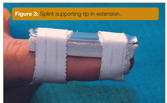
Figure 3: Splint supporting tip in extension.