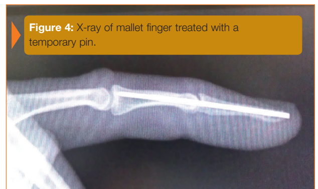
Figure 4: X-ray of mallet finger treated with a temporary pin.