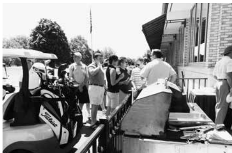
Lining up for lunch before shotgun start