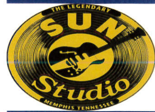
Experience famous Sun Studio

Departure: Pickaway Senior Center, 2105 Chickasaw Dr, Circleville, OH @ 8 am