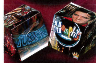
Guided Tour of Memphis, TN