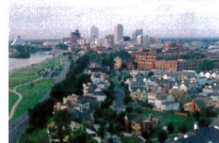
World-class Gaming in Tunica