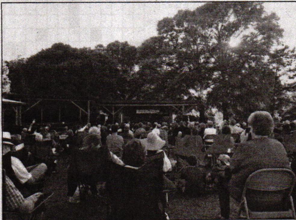
Guests enjoy the sounds of Guy Penrod.