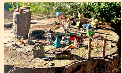
In the meantime, as long as we have stumps on Lake 2, some imaginative neighbors have created a woodland fairy scene on one of these stumps.

Unfortunately, a vehicle struck the community monument at Windfern Road, causing damage. We are actively obtaining repair bids and working with the Sheriff's Office to identify the responsible party. If any residents have information related to this incident, please contact HOA management so it can be shared with law enforcement.