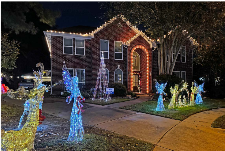
8746 Serenade Lane