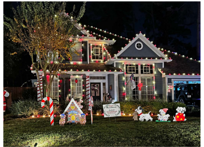
9303 Sinfonia Drive