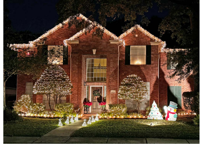
8918 Andante Drive