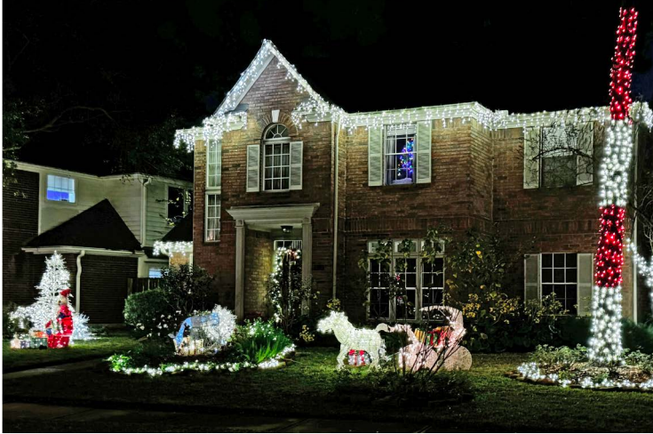
9207 Brahms Lane