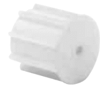
Designer Metals ™ Part #73405058