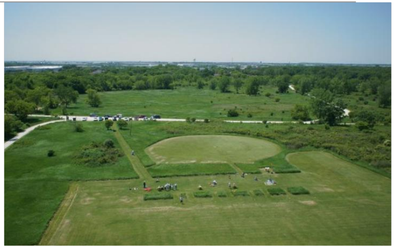
Woodland Aero Modeler's Flying Field at Waterfall Glen Forest Preserve, Lemont, Illinois

That brings us to a plan for next year. 1. We'll have two Open Houses on the Saturday and Sunday after Clow. Hopefully we get at least one good day. 2. We have a greeter to welcome folks and get them started. People walked in and no one talked to them! No one should enter the Club Field without a