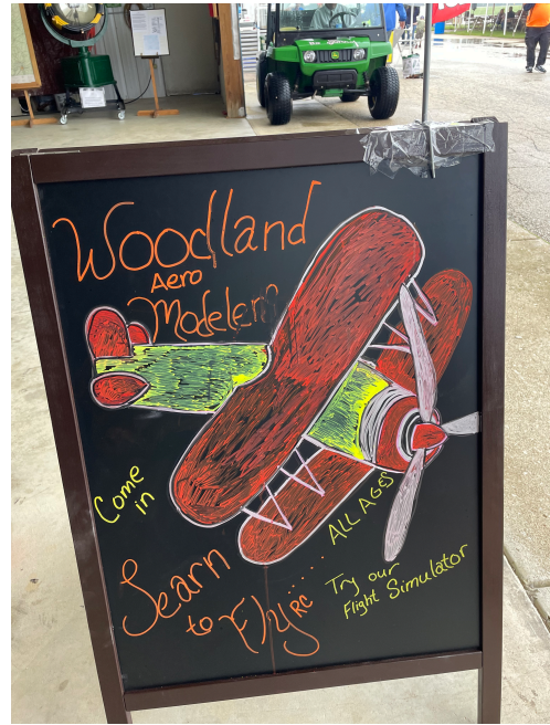
Many thanks to Tim's sweetie for our sign!