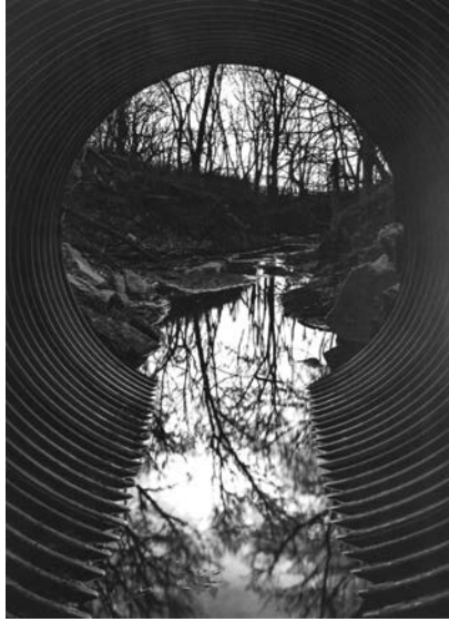
Ye Wang “Inside Out” photography (14” x 10”) $300 Cash Award