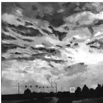
Moe Paw "Late Evening" oil (30" x 36")