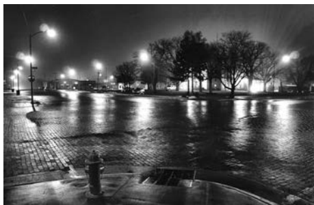
Rick Thompson "Wet Bricks" photography ( 11" x 14")