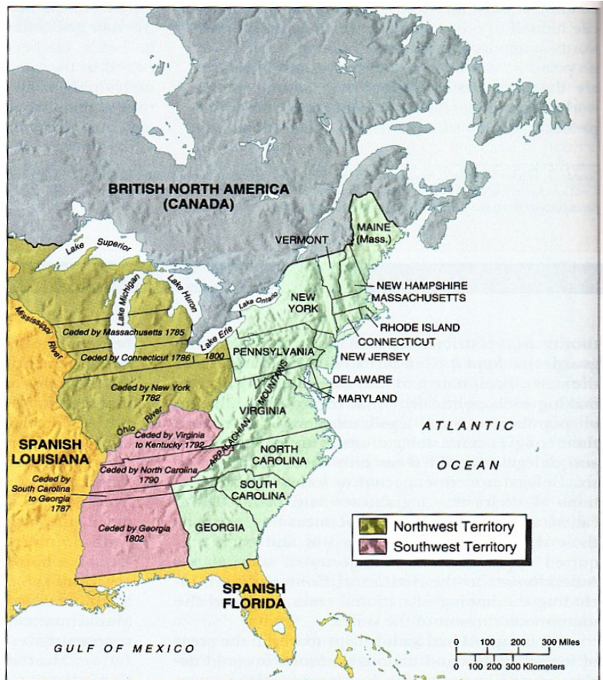
Federal/Public Domain Land Created from State Cessions under the Thirteen Articles

One other development – The Land Ordinance of 1785 -- will also help the Federal Government finance itself over the long-run.