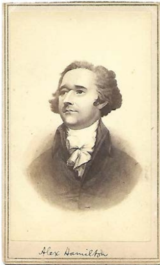
Alexander Hamilton (1755-1804)

The perils of this bankruptcy are best known to the soldiers fighting the war, especially George Washington and his principal aide-de-camp, Alexander Hamilton. Both men are Federalists, and together they push Congress to name a “Superintendent of Finance” to restore the American economy.