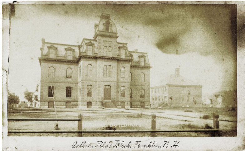
First Franklin High School, at School Street