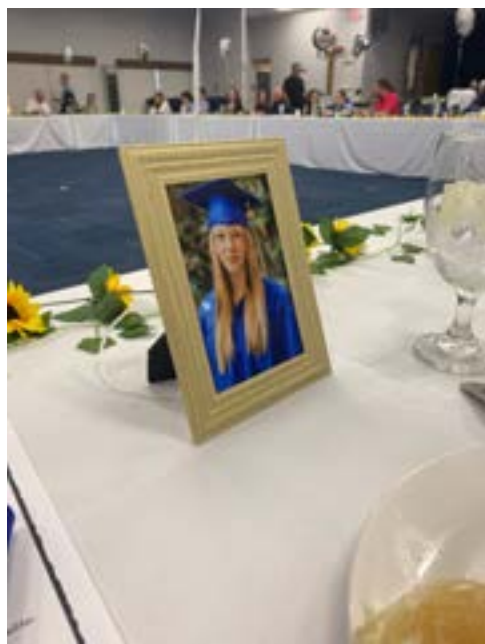
The Eighth-Grade Blessing Dinner