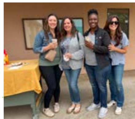
Below: Parents enjoying the TCS coffee cart.