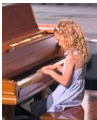
Left: Talent show