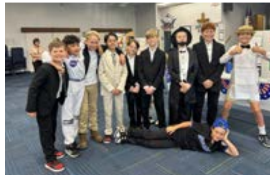
Above and left: Fifth-grade students participated in the annual Living Museum.