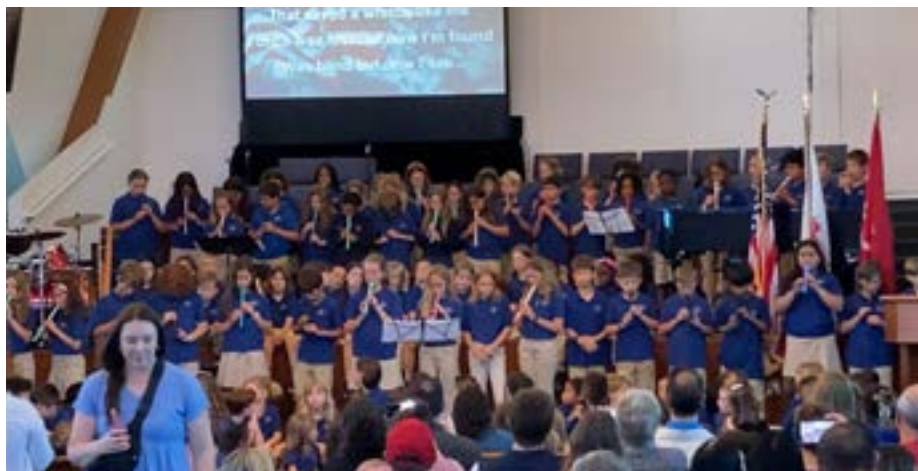
Above: Patriotic Chapel