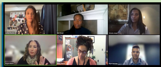
Maritime Industry professionals from the BIPOC Mariner Panel Discussion: No One Size Fits All, Language to Talk About Race & Ethnicity.