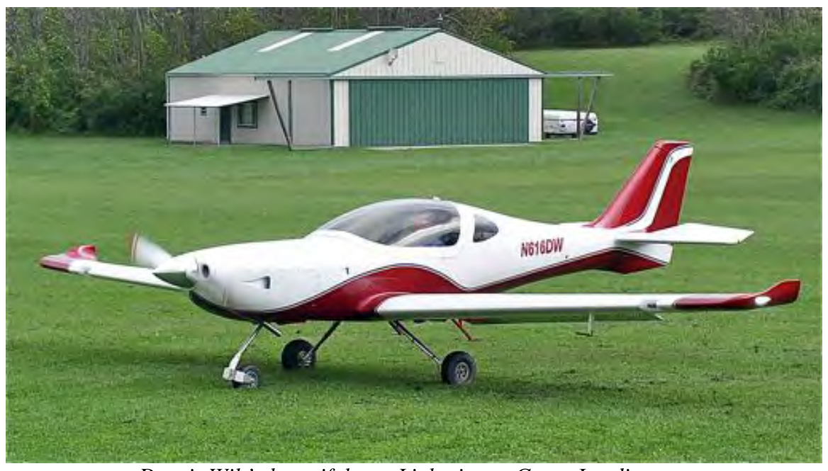
Dennis Wilt's beautiful new Lightning at Green Landings on the day of its first flight

Volume 4, Number 9 October/November, 2011