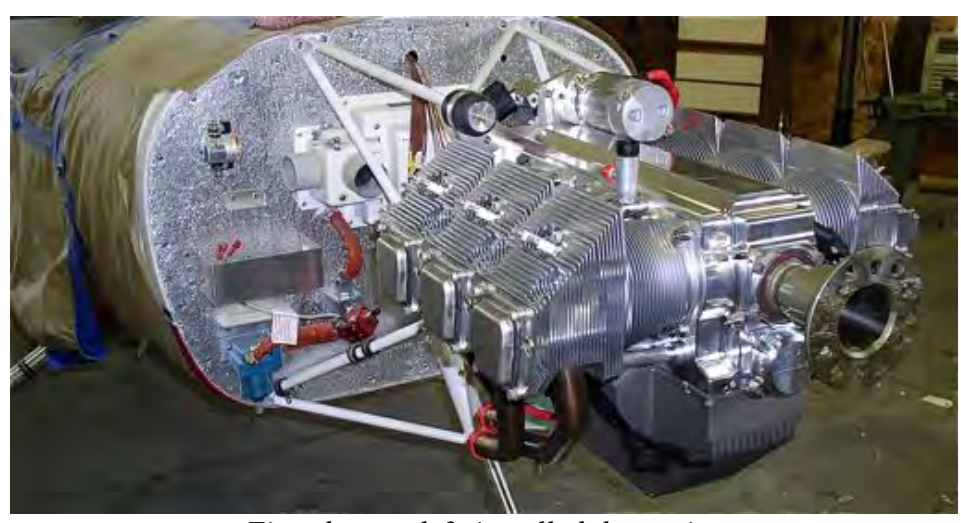
First day week 3, installed the engine