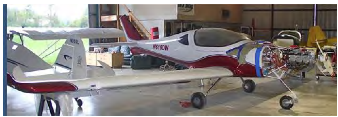
The end of week 3

At the end of week 3, the plane was close, but not ready for inspection. It still had some wiring to complete, the interior was not done, the rudder wasn't installed, and a whole bunch of little things needed to be done, but it was getting close. One thing we did was change the brake lines from the clear plastic to another system that uses a different connection system (they can be re-used, too) and can handle up to 3000 psi of pressure. The lines from the inside of the airplane to the calipers are braided and I liked that much better than the lines that came with the kit. They are much harder to route since they are much stiffer than the other lines, but I don't think I'll be having any leakage issues.