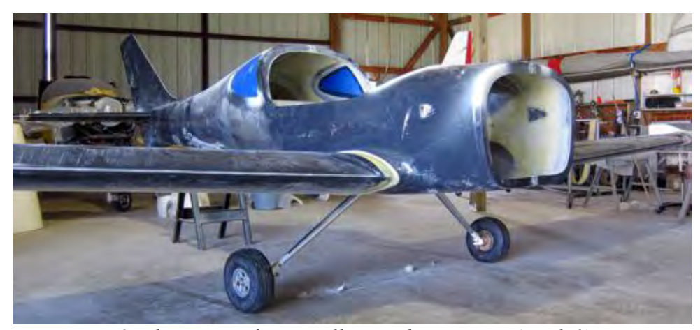
On the mains after installing and setting toe (week 1)