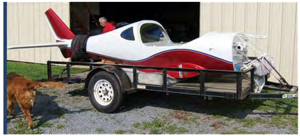
Beginning Week 2, back from paint