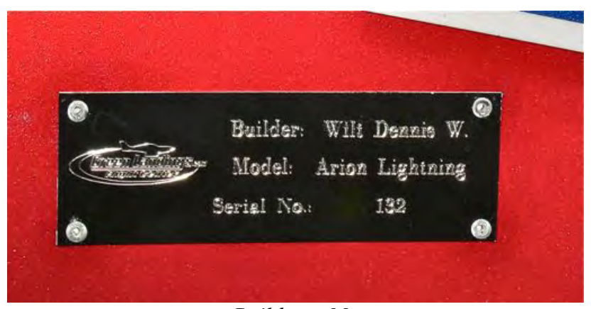
Builder = Me