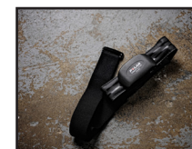
Heart Rate Chest Strap