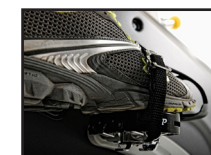
Sports Performance Pedal