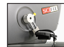
Adjustable Pedal Cranks