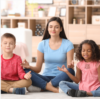
How do we practice taking care of ourselves in the moment during a busy time?