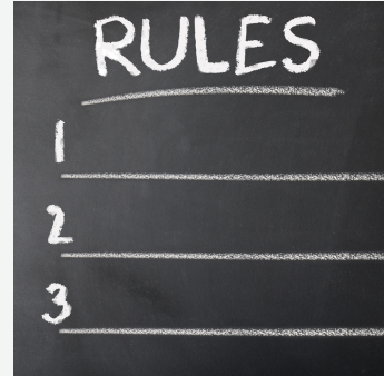
Rules, how you can help get more desirable behavior and set up effective rules?