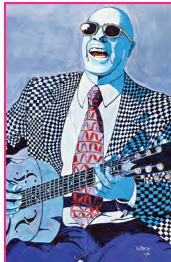
Original art by Artist Samuel Pace, Los Angeles, CA

Are you looking for original oil or watercolor painting, pottery or one of a kind sculpture? What about custom jewelry, glasswork or mixed media? The Northwest is home to many talented fine artists and crafters. The Festival invites and proudly presents a limited and select number of professional artists from Washington, Oregon, Idaho and California to display and sell their art during the Festival.