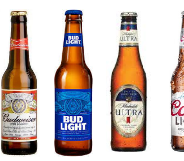
Budweiser 2.75 Bud Light 2.75 Michelob Ultra 2.75 Coor's Light 2.75