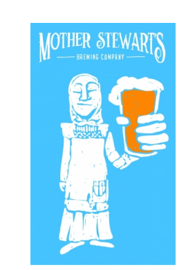
Subject to Availability