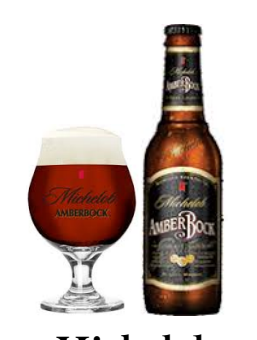
Michelob Amber Bock 2.75