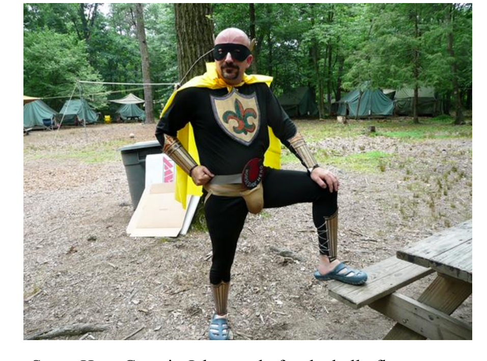
Super Hero Captain Jake, ready for the belly flop contest