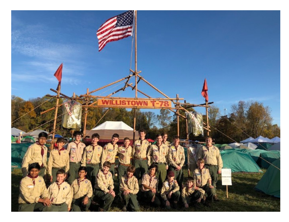
Chester County Council Camporee