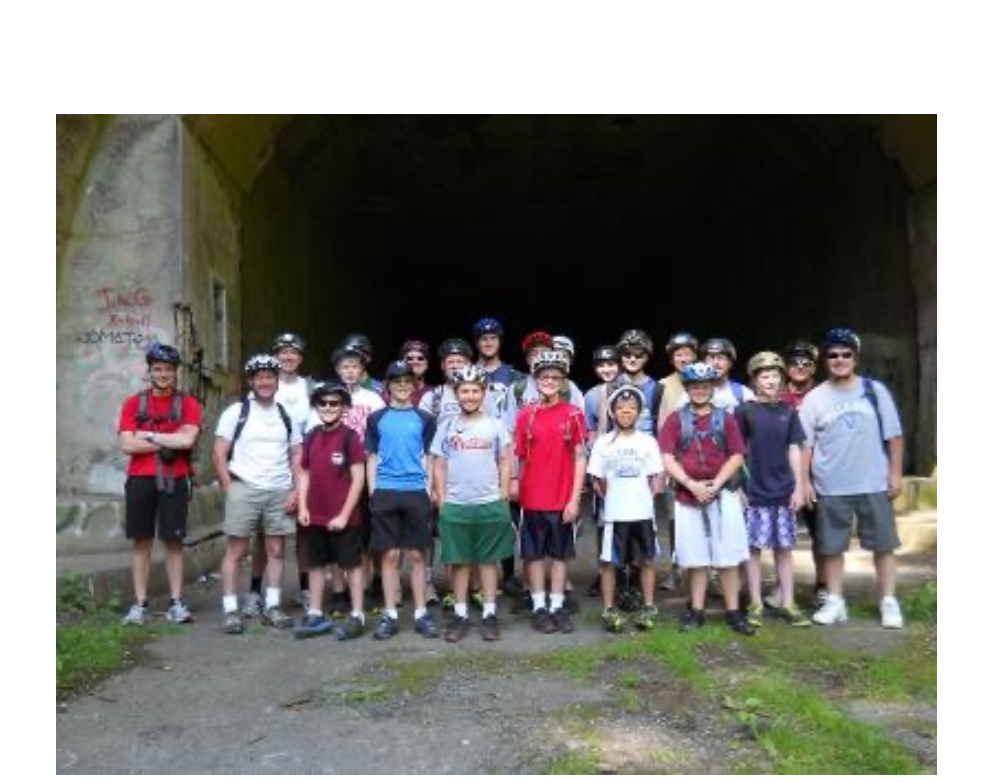
Rays Hill Tunnel abandoned section of the PA Turnpike