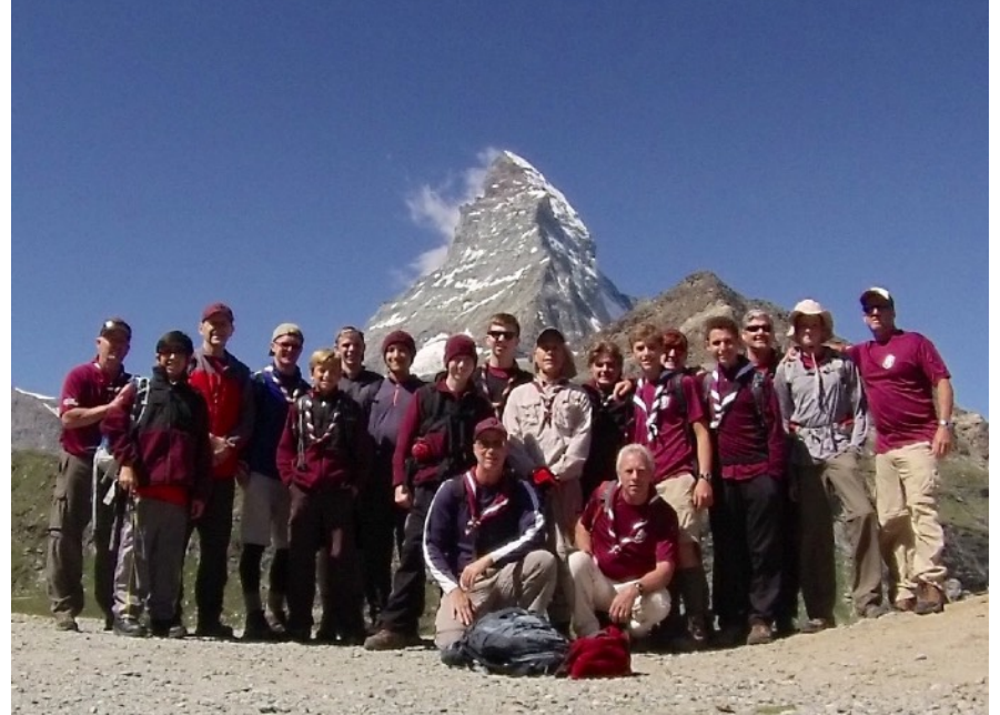
Troop 78 at the Matterhorn