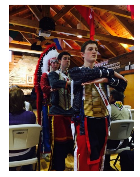
Order of the Arrow tap out

time over the past many decades. We take great pride in keeping our history alive through Patrols that also have been in existence for most of the Troop's years. We are pleased that so many of our alumni are joining us today to celebrate our Troop's past.