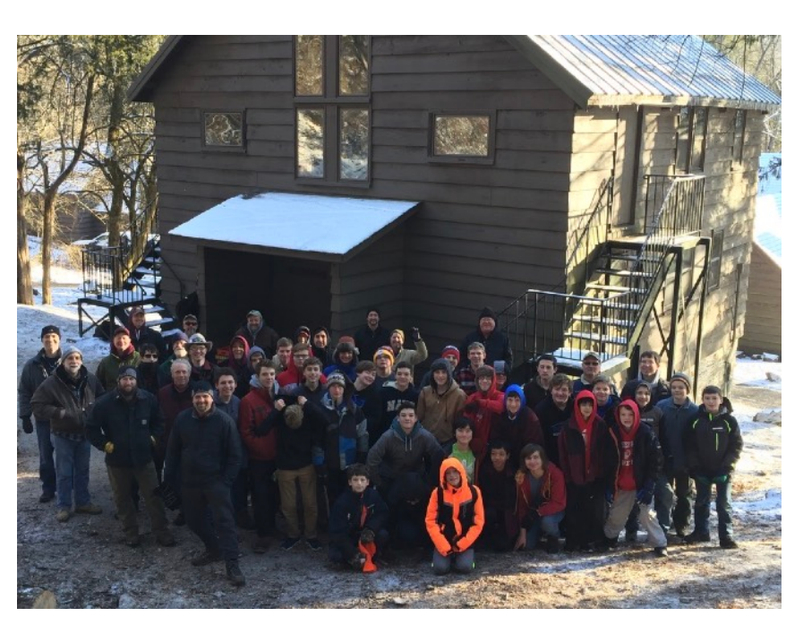
Winter Camp at Browning Lodge