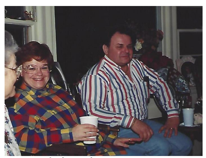
A picture from yesteryear

Roadster pickup, runs well Very nice condition $10,000. Call Mike, 973-267-2958 NOTE: I have pic-Paul