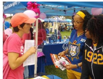
Photos above was taken at Last Year's Festival 2018.