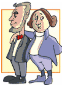
Presidents Day, Feb 21st