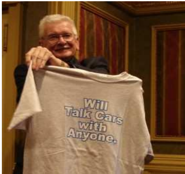
Should it be "Will talk to anyone????"