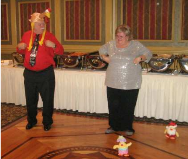
The two chickens and their offspring?