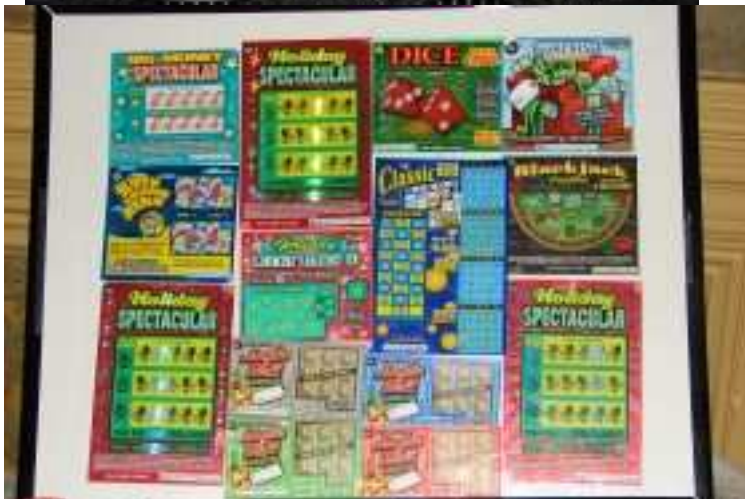
Lottery Board - any winners Henry?

Some people are like "Slinkies" - not really good for anything, but you can't help smiling when you see one tumble down the stairs.