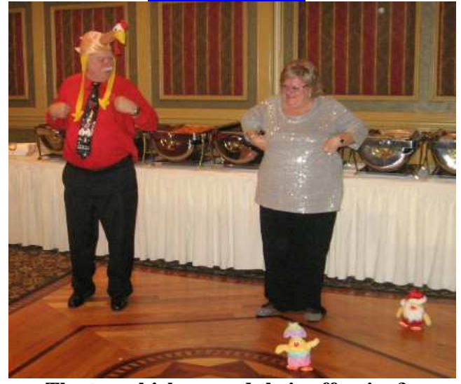
The two chickens and their offspring?