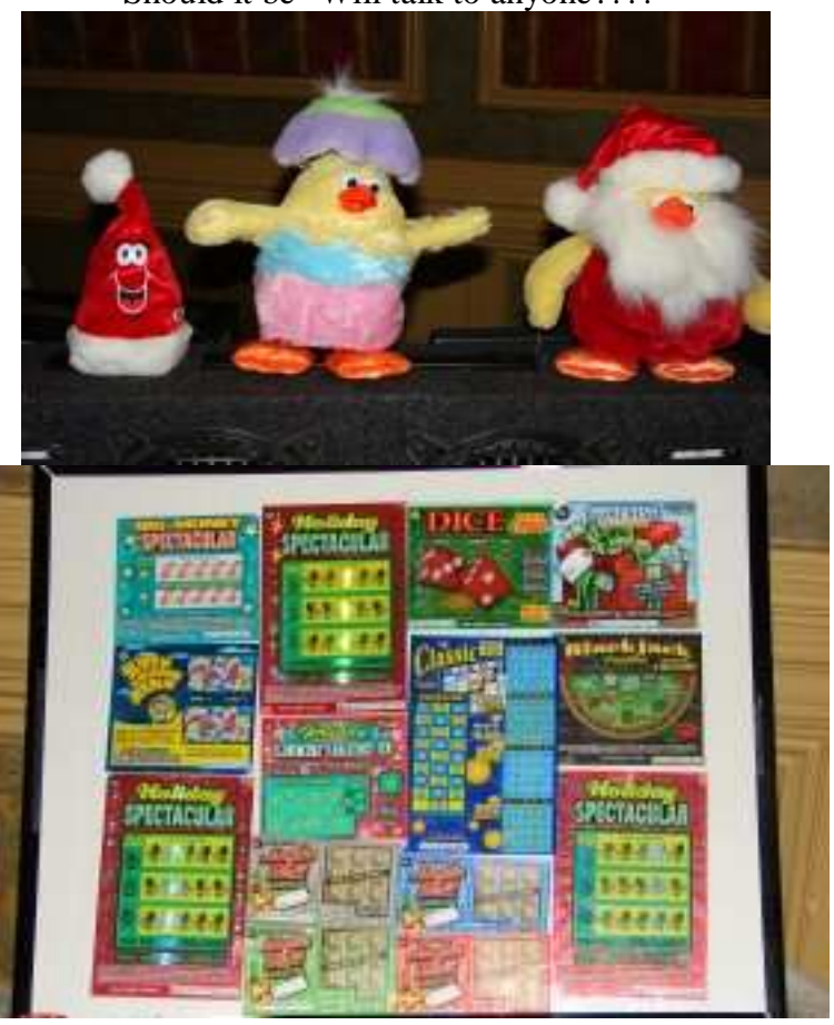
Lottery Board - any winners Henry?

Some people are like "Slinkies" - not really good for anything, but you can't help smiling when you see one tumble down the stairs.