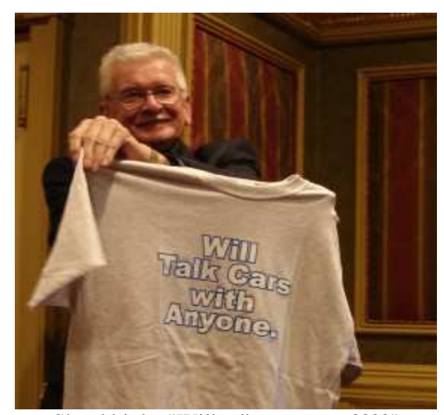
Should it be "Will talk to anyone????"