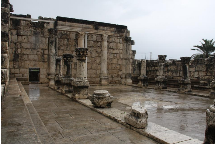
📍 Sea of Galilee