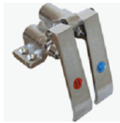
Hot & Cold Valves