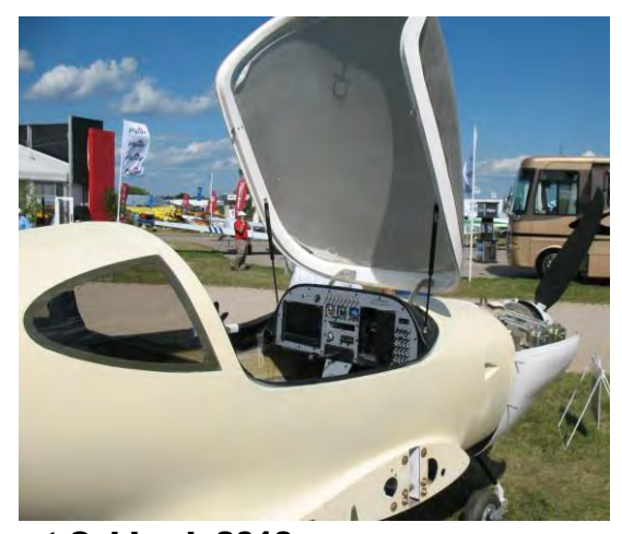
O-320 Lightning on display at Oshkosh 2013.