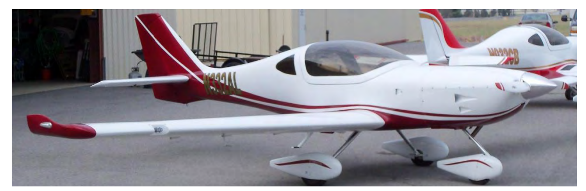
Slightly used SL-1 for sale at factory, 80 hours TT, asking price $110K.

Are you looking for a slightly used LS-1 Lightning? N332AL has only 80 hours total time, no damage history, all ADs and SBs complied with, Grand Rapids EFIS 8.5" screen with Trutrack AP and internal GPS. Equipped with 22 gallon tanks which equates to over 3 hours flying time (with plenty of reserve) at cruise speed. Aircraft is located at the Shelbyville factory at an asking price of $110K.