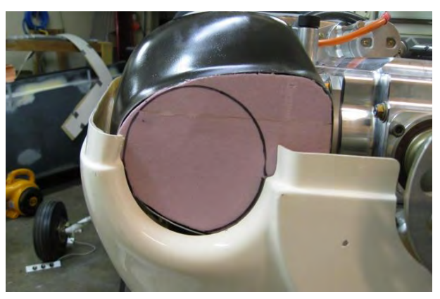
Original shape of Jabiru supplied intake ducts.