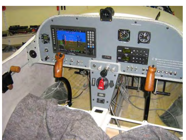
Throttle set up on Gerd's first Lightning.