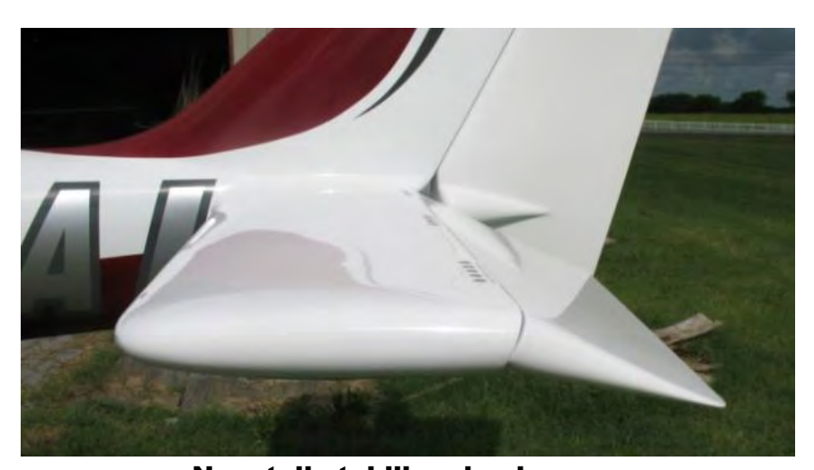
New tail stabilizer in place.

If an owner was on the fence about making the change they still have until September 30<sup>th</sup> to place an order at the old discount price. Delivery time is 4-6 weeks. The stabilizers will drop ship directly from Custom Fiberglass.