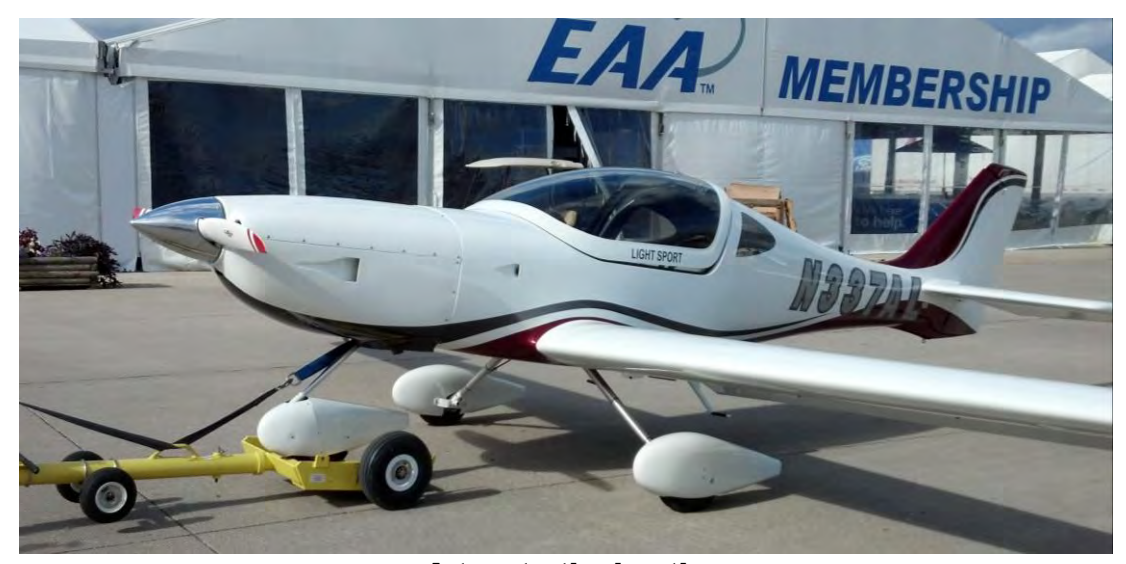
A tow to the booth.

Those who may doubt the stoutness of the landing gear or the effectiveness of the cylinder head cooling of the Lightning need not worry. The CHT's stayed well within the green and the landing gear and wheel pants made the trip through the rough grass with no problems. Finally, with three planes in front of us before we reached concrete we were told to stop and shut down for the Mooney arrival so they could taxi by us en masse. Oh well, that's Oshkosh! At least when we arrived at Phillip's Plaza there was a tug available to pull the LS-1 to our booth where we tied it down for the night.