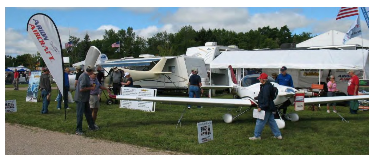
Lots of traffic through the Lightning booth all week.

There was no Light Sport Mall this year at Oshkosh (a result of booth price increases and the new "college/university row" where the mall used to be) so we had plenty of dealer representation in the booth.