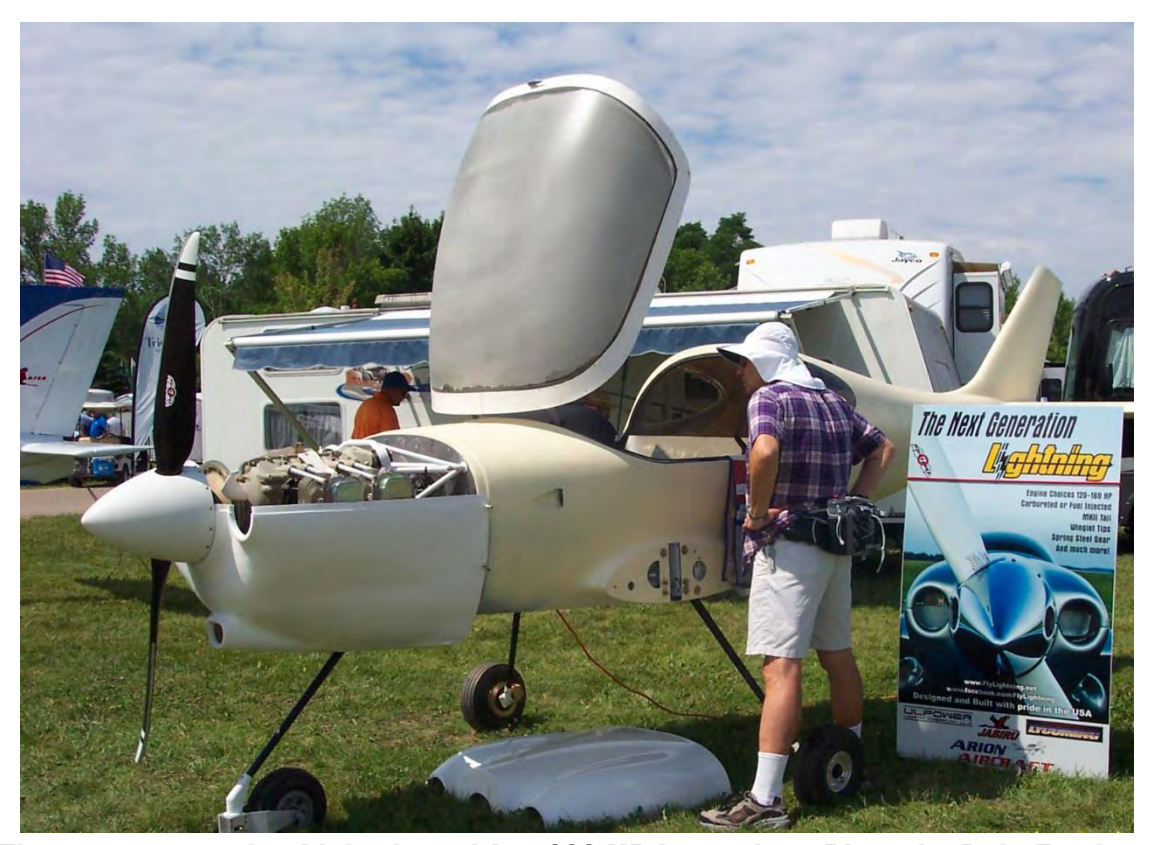
The next generation Lightning with a 160 HP Lycoming.

Both Nick and Mark told me that they had a good group of people through the Lightning booth every day of the show. I will have various photos made at the Lightning booth below. Also, from what I have read, many of the vendors (over 800) reported strong sales during the show. I certainly hope that some of the attendees will decide that they need a new Lightning — either an SLSA LS-1, or an Experimental Amateur Built version to include the new Lightning XS with the 160 HP Lycoming engine. More on that aircraft below.