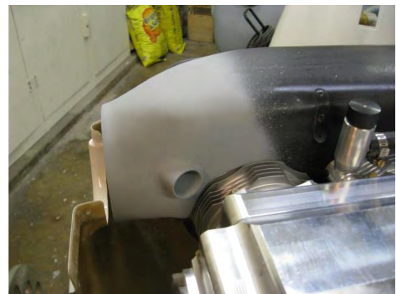
Bernardo's newly modified intake ducts.