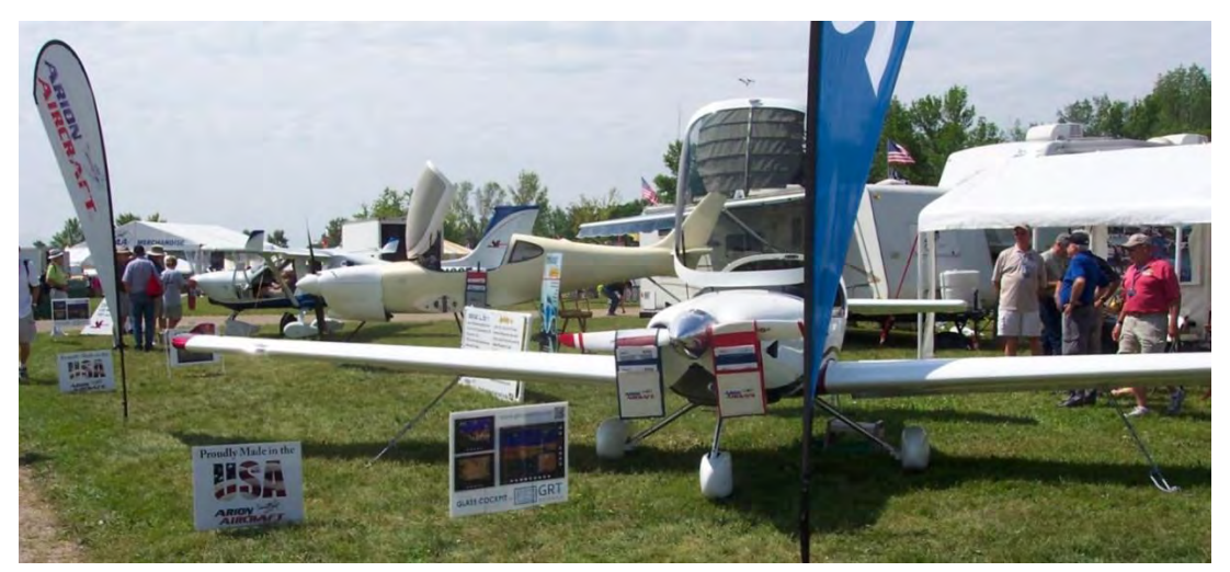
Oshkosh 2013 Lightning Booth.

One of the highlights of this year's Oshkosh Fly-In was the screening of Disney's new "Planes" movie which drew a recond15,000 people to the Ford Fly-In Theater. I have recently seen the movie and for airplane lovers, it is a fun movie. Actually I have seen it twice – once with my 3 year old grandson, and once with my 2&1/2 year old granddaughter. They both really enjoyed it.