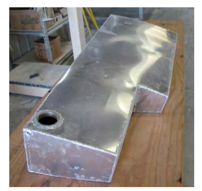
Car gas any one? New aluminum fuel tank option. Look for a price soon.