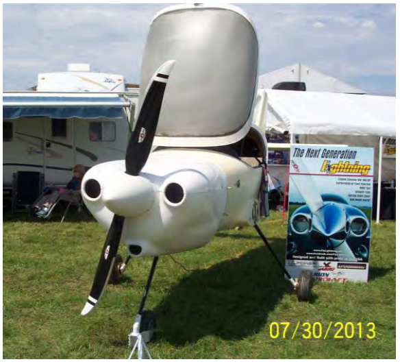
More photos of the new 160 HP Lightning. Note the longer gear legs which allow for a longer prop with good ground clearance.