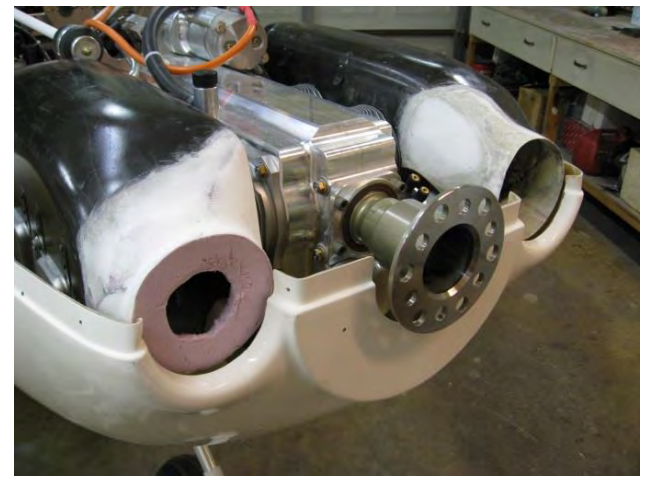
Bernardo modifying the ducts to hopefully improve airflow to the engine.