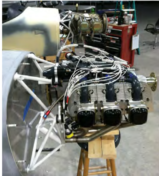
Left photo, Doug and Ronda Guy install their UL Power 390iS. They will be the first Lightning in the US to fly with this engine. On the right is their engine in the foreground with a Superior O-320 in the background. Both are 160 HP.