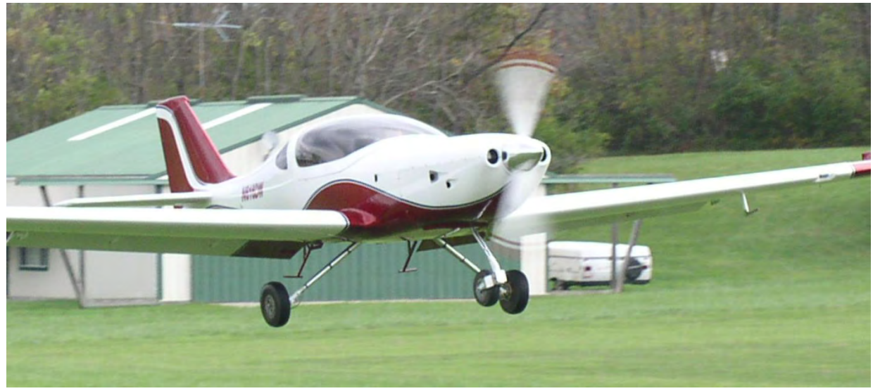
First flight made October 21, 2011.