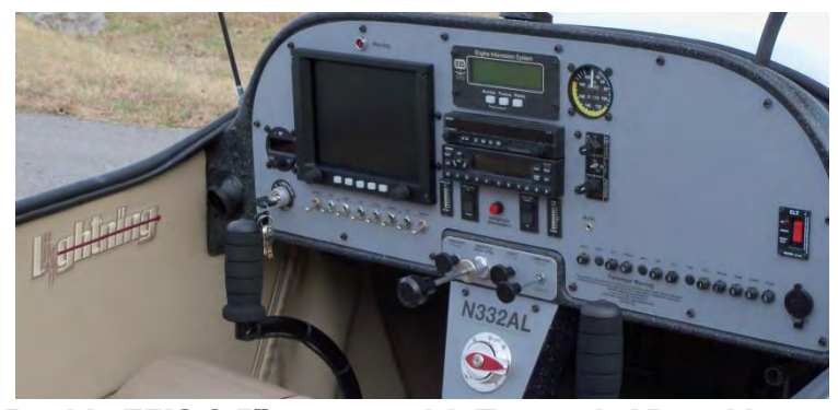
Grand Rapids EFIS 8.5" screen with Trutrack AP and internal GPS