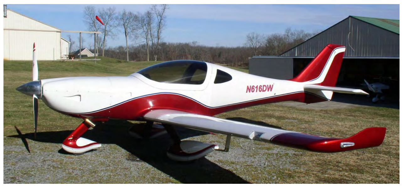
January 2012 - Ready for the flight to Florida.

I have surely enjoyed my Lightning since I flew it home from Green Landings. The really nice side view of the plane by itself (see below) is the morning I began my flight home on a very cold January 2012 morning.