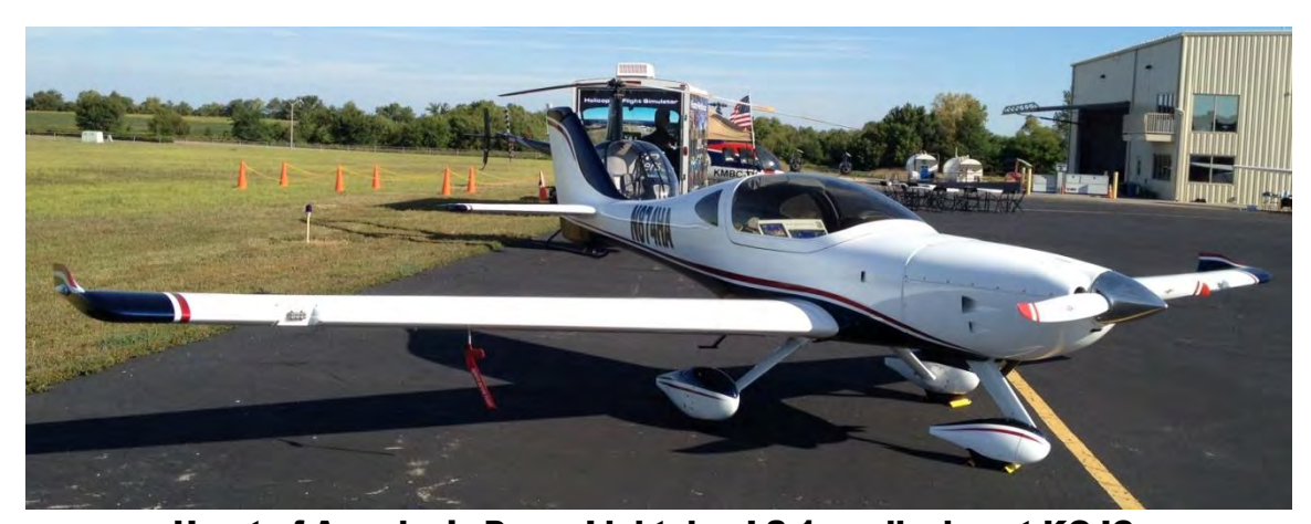
Heart of America's Demo Lightning LS-1 on display at KOJC.

The show was interesting as they made it as easy to attend as possible, free parking, free attendance, free use of the provided kid's entertainment activities and a hot dog lunch with chips and drink for a buck! Not only was there no cost for me to attend and show the Lightning, they were genuinely happy to have me there showing an example of another facet of general aviation. As it turned out, I was the only LSA dealer there. Air Associates didn't even show either of the two SkyCatchers that they operate.