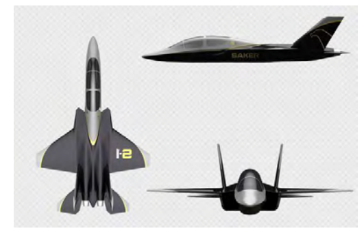
Crew: 2, Max Speed: Mach 1.1, Cruise: .99 (Note - Does not meet Light Sport Regs.)