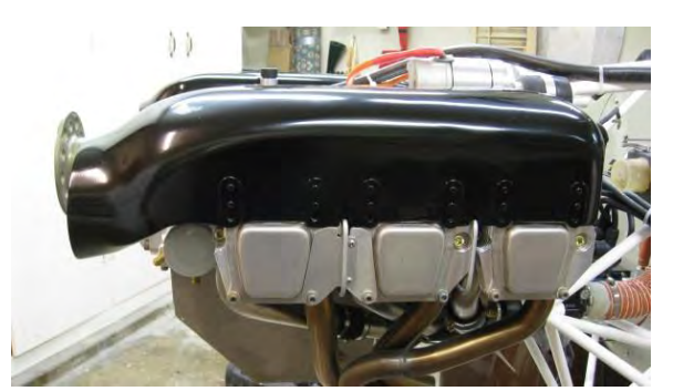
All painted and installed. Looks great.