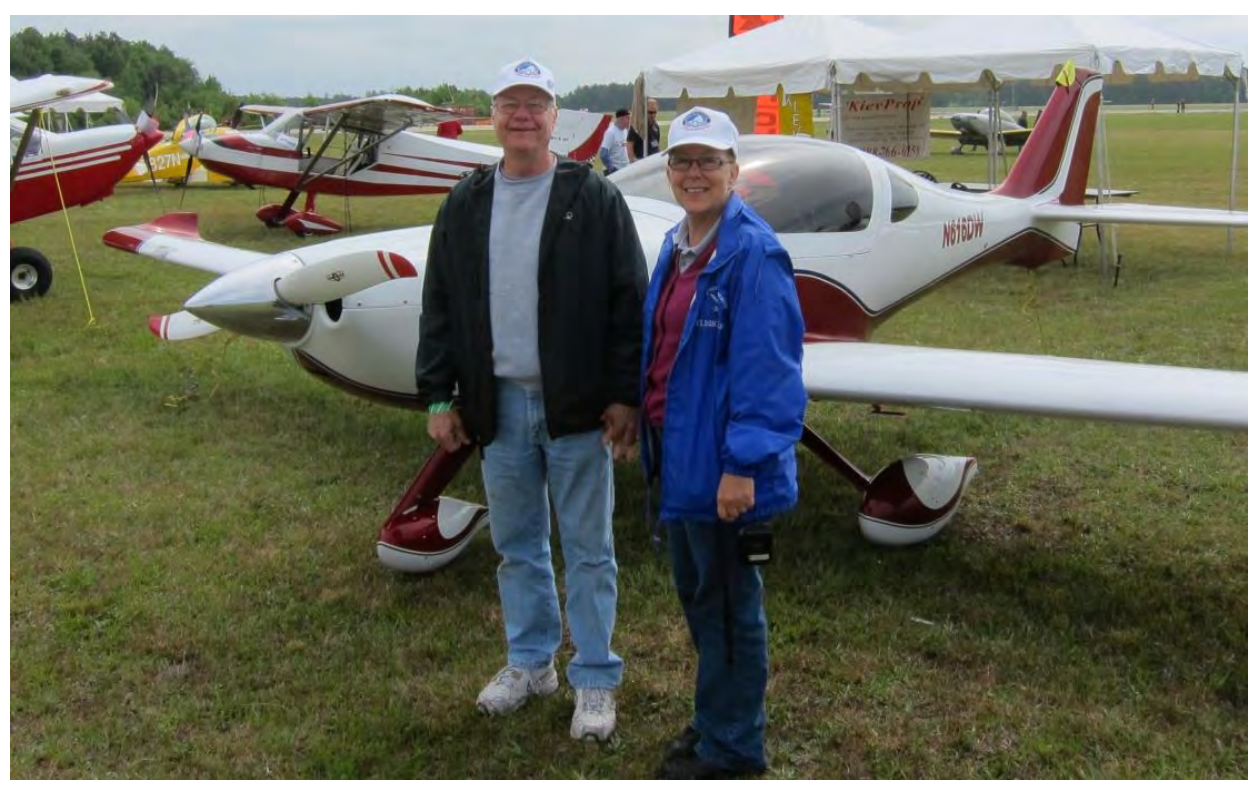
2012 Virginia Festival of Flight at Suffolk Airport

In May of 2012, Donna and I flew the plane to Suffolk for the Virginia Festival of Flight and we had a lot of fun re-connecting with our friends in Virginia. I have also added a picture (see below) from the VA Festival of Flight.