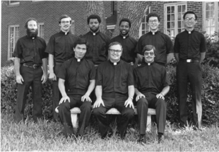
Novitiate Class of 1982 in Bay Saint Louis, MS