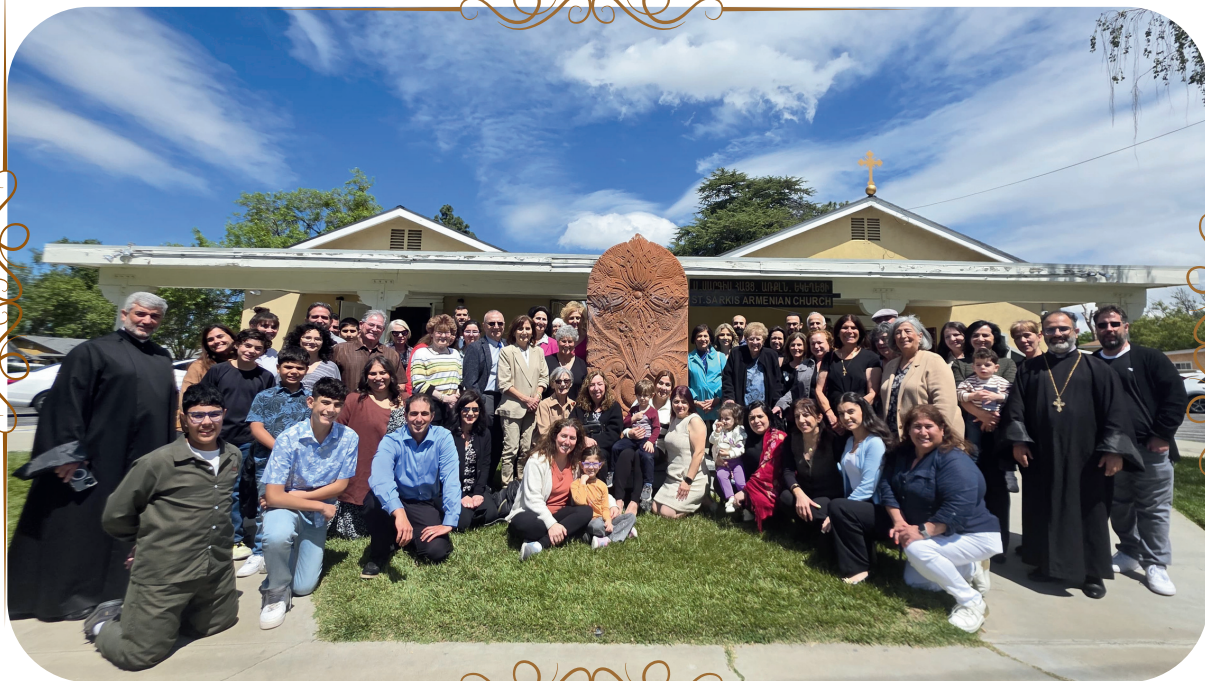
Pilgrimage to St. Sarkis Armenian Church of Santa Clarita - Sunday, April 12, 2026