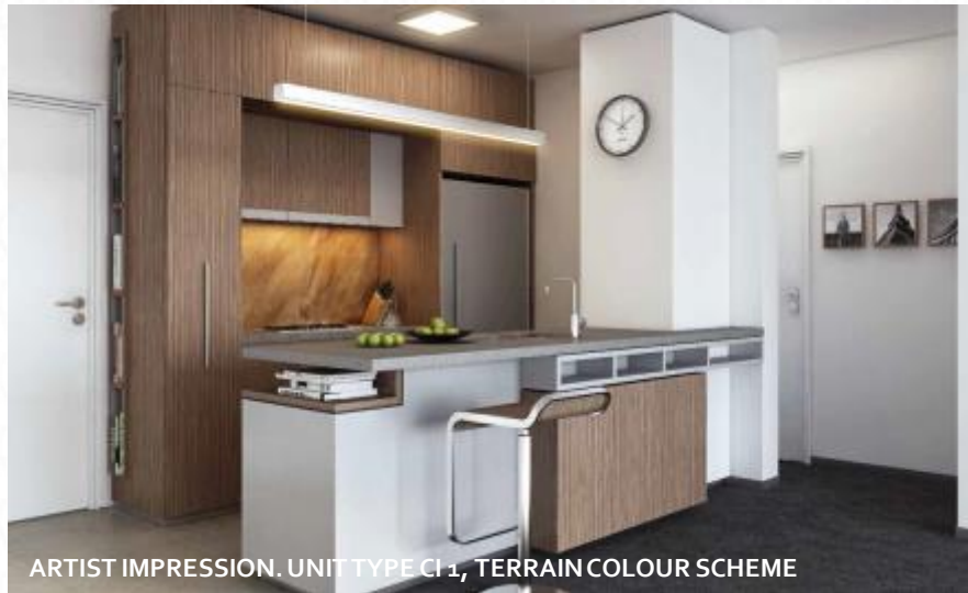
ARTIST IMPRESSION. UNIT TYPE CI 1, TERRAIN COLOUR SCHEME