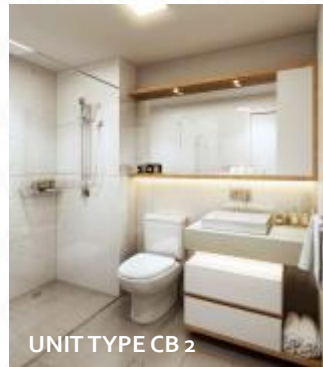
UNIT TYPE CB 2