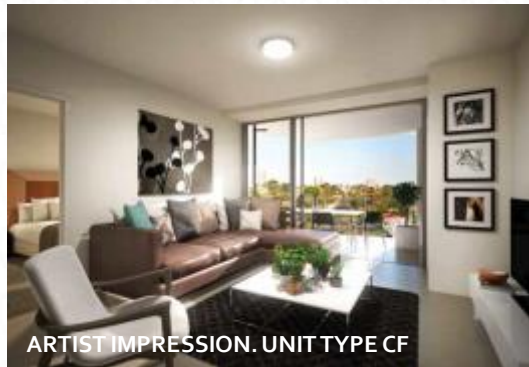
ARTIST IMPRESSION. UNIT TYPE CF