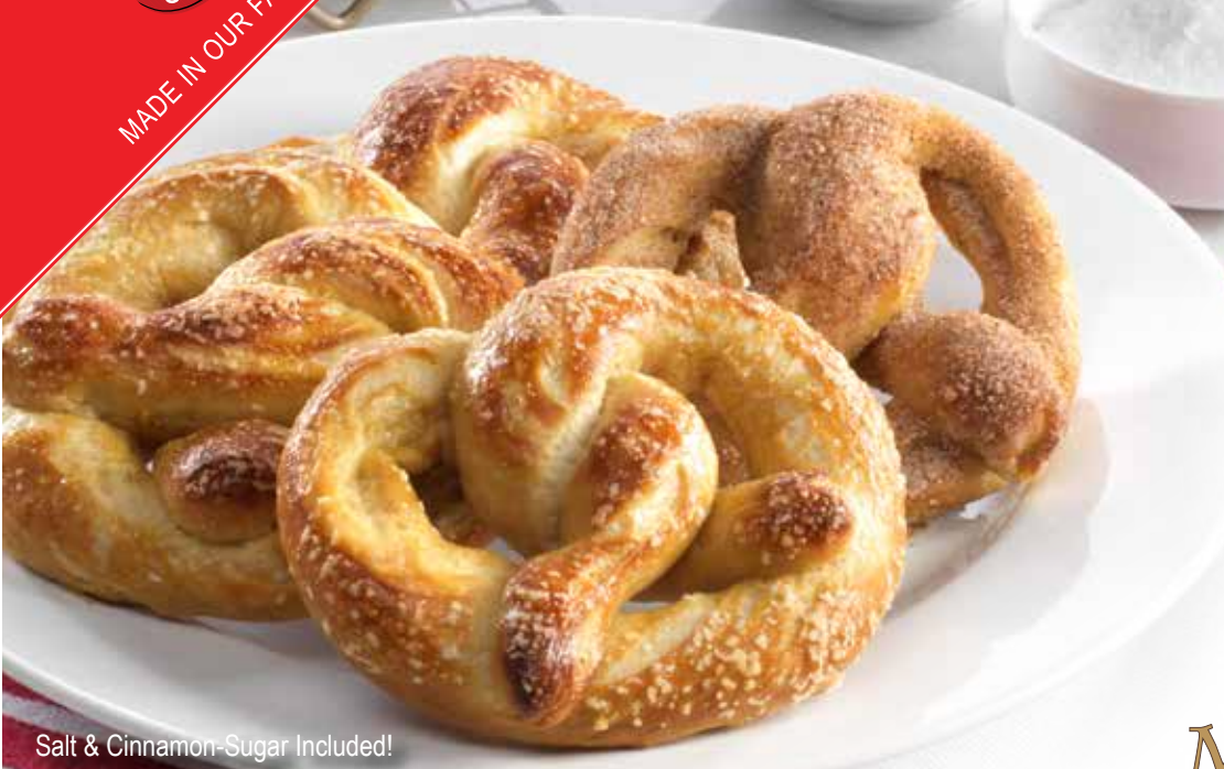
Salt & Cinnamon-Sugar Included!