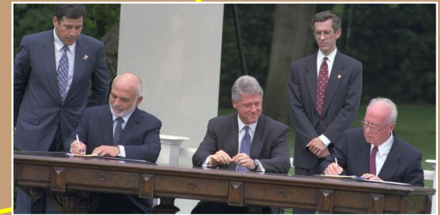
ISRAEL-JORDAN PEACE TREATY 26 OCTOBER 1994