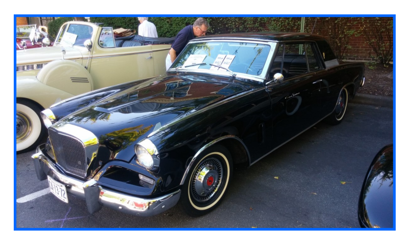
1962 Studebaker Hawk Steven White