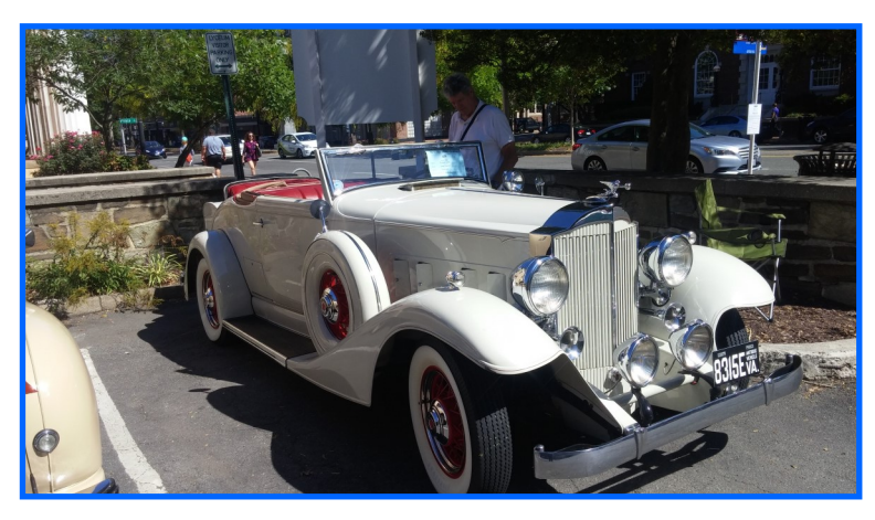
1933 8 Coupe Roadster Scott Leaf

1955 Clipper Constellation Craig Coulombe