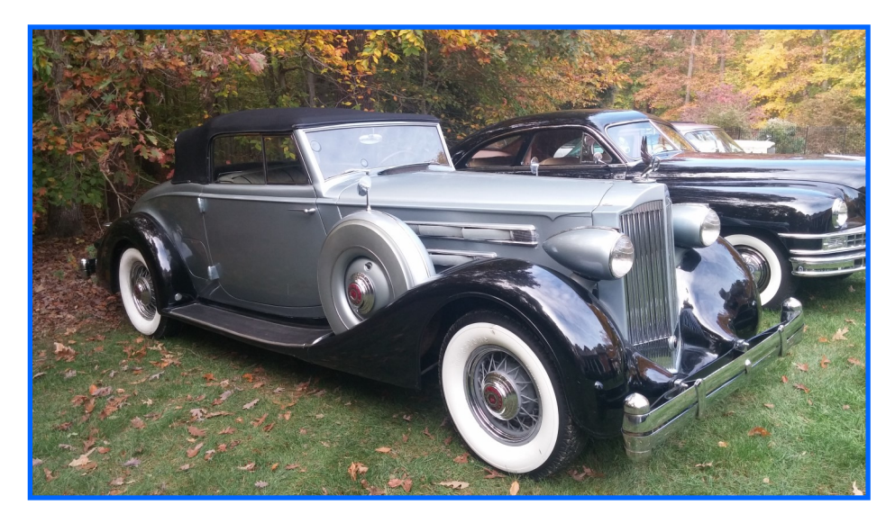
Orin Kerr's 1935 12