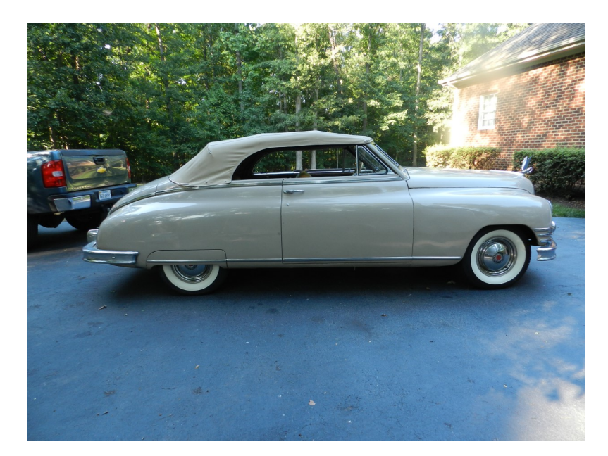
1949 Packard Super Eight Convertible with O/D - $38,500 OBO

Contact Bob Powell for details - rlplkp@comcast.net or (804) 389-2555