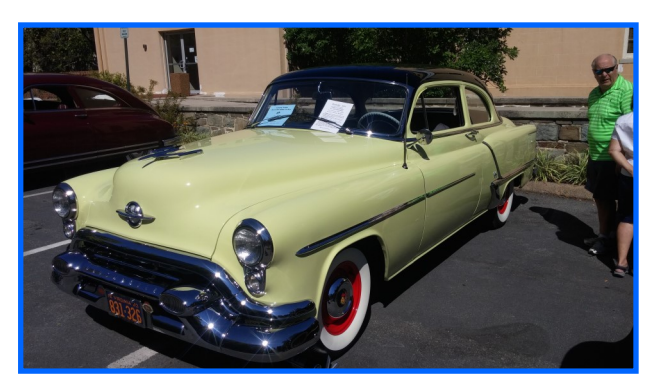
1953 Oldsmobile Super 88 Steven White