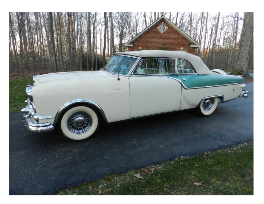
1954 Packard Caribbean Convertible - $47,500 OBO