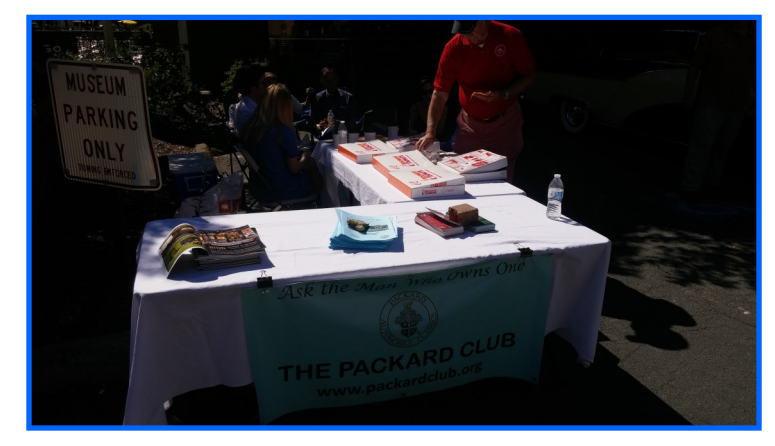
Our display table with donuts, water and later pizza