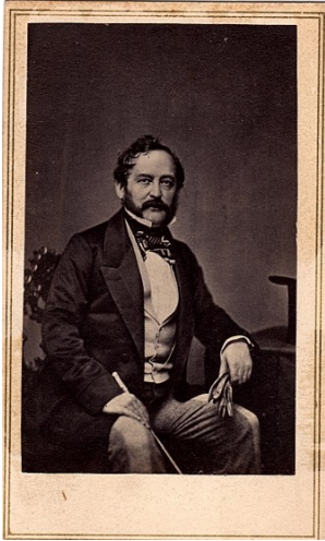
Edward Stoeckl (1804-1892)

While Lincoln seeks more information on Ft. Sumter, his Secretary of State is busily telling all comers that the fort will soon be evacuated.