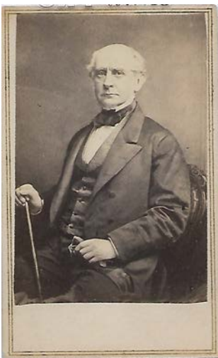
Charles F. Adams (1807-1886)

As more days slip by without a public decision, the pressure on Lincoln mounts from all sides, especially from Northerners siding with Seward.