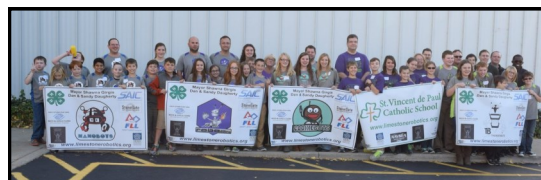
ABOVE: 4-H Limestone Robotics team members garnered multiple awards at the FLL Trash Trek Qualifications Tournament in Columbus, Ind., Nov. 14.

The Cookiebots team was awarded second place in Innovative Solution, and the Epic