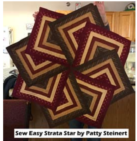
Sew Easy Strata Star by Patty Steinert