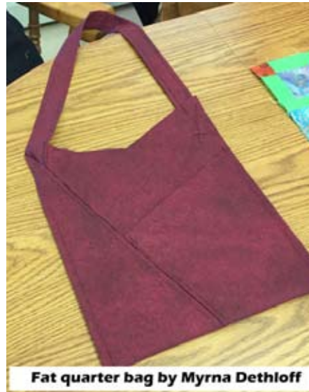
Fat quarter bag by Myrna Dethloff