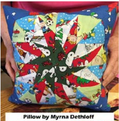
Pillow by Myrna Dethloff