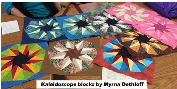
Kaleidoscope blocks by Myrna Dethloff