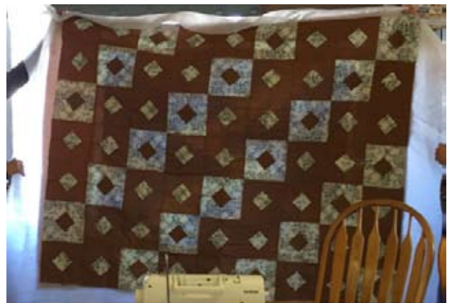
Back side of Bargello by Pam Fenoff