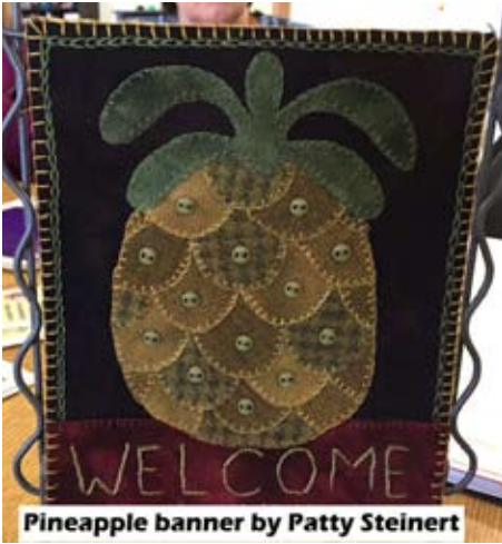
Pineapple banner by Patty Steinert