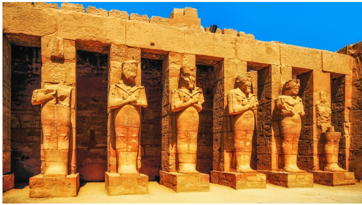
Karnak Temple ~ Luxor

Nile" (southbound) to Esna. Then continue to Edfu where you will overnight on board. (B,L,D)