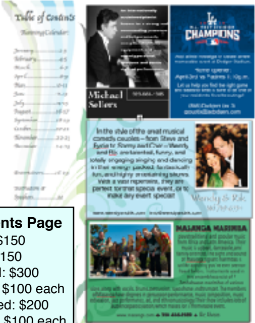
Table Of Contents Page Top Right: $150 Top Left: $150 Top combined: $300 Middle Left/Right: $100 each Middle combined: $200 Bottom Left/Right: $100 each Bottom combined: $200

Back Cover Top Half $600 Bottom half $500