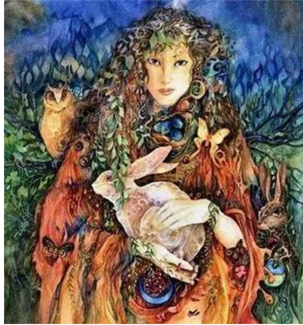
The Goddess Eostre