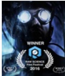
RAW Science Film Festival Winner