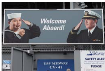
What's with the left-handed salute?