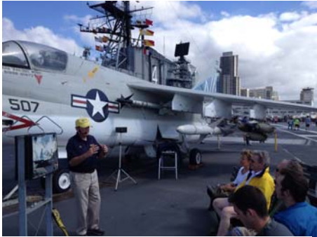
Intruder Pilot Presentation

lier. The naval battle at Midway was a decisive American victory. A movie on the legendary naval clash will premier in a new theater on the Midway's hanger deck in 2015.