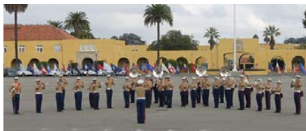
Marine Band performs

The graduation featured an opening performance by the Marine Band featuring a Jazzy de-