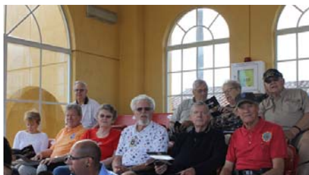
In the VIP Suite

This time I was accompanied by my wife and my fellow AFV-Ners . We sat in the reviewing stand as VIP's with smiles and laughter as we waited for the