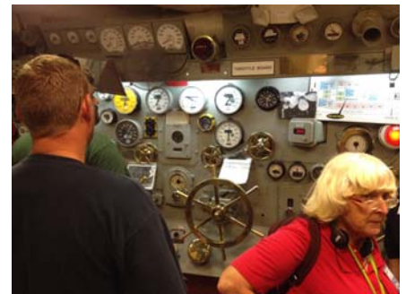
Engine Room Panel

flight deck I was walking on." The Midway was still saving Vietnamese 14 years later, when the carrier group rescued 92 "boat people" on two wooden sampans, while crossing the South China Sea .*