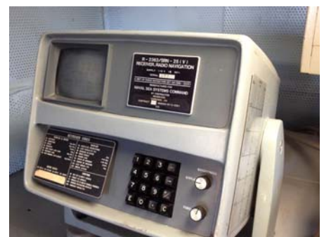
Old GPS System

The Navy selected the ideal class of warship as the namesake for the 1942 Battle of Midway . Five carriers were sunk, four of them Japanese . Nearly 400 planes were destroyed (both sides combined) during four days of fighting. Some of the Japanese ships were the same ones that attacked Pearl Harbor a few months ear-