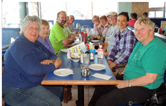
At the fish & chip restaurant