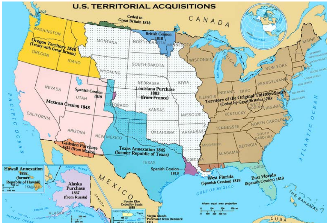
Map Showing The 550 Mile Strip Along The New Mexico And Arizona Border Acquired In The Gadsden Purchase