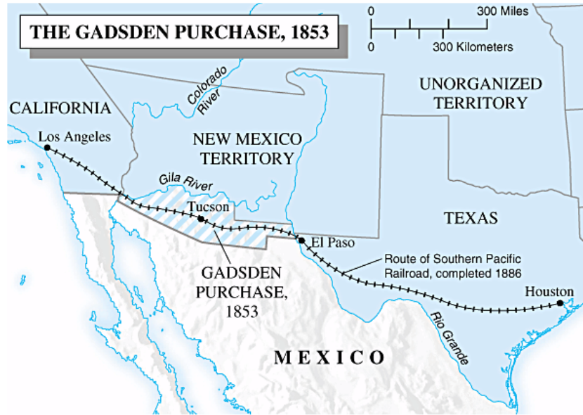
Map Showing The Eventual Route Of The Southern Pacific RR Across The Gadsden Purchase Land