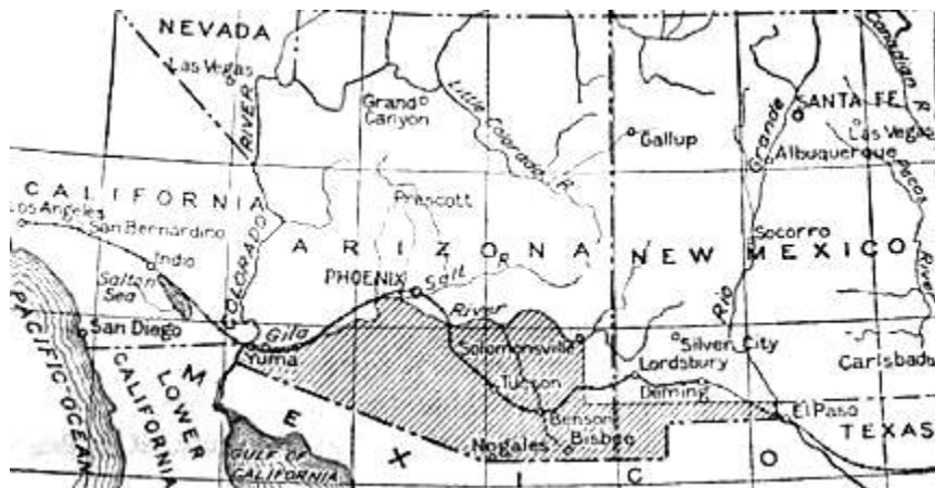
Map Of "Disputed Land" From The Mesilla Valley (West Of El Paso) To Yuma, Arizona

Although a survey for the 1848 Treaty clearly designates the valley as Mexican land, the second Territorial Governor of New Mexico, William Lane, suddenly lays claim to it on May 18, 1853. This results in a show of force by Mexican troops and Pierce's dismissal of Lane to quell the tensions.