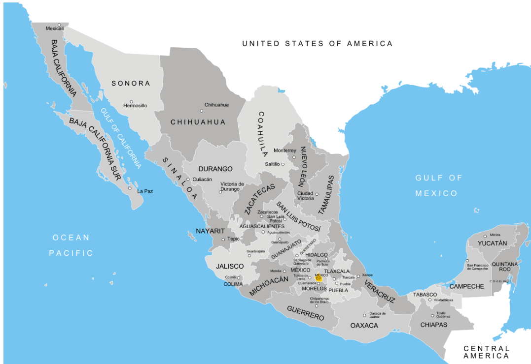
Map Of Mexican Province Including The Topmost Four That The U.S. Tries To Buy

The President of Mexico at the time is the peg-legged fifty-eight year old General, Antonio Lopez de Santa Ana, infamous in America for his massacres at The Alamo and Goliad during the 1836 Texas Annexation period, and revenged upon by Generals Jackson and Scott in the 1846-47 War.