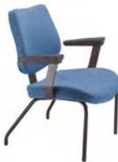
4001 P A : 20" C : 18" E : 15"