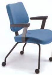
4001 PR A : 20" C : 18" E : 15"