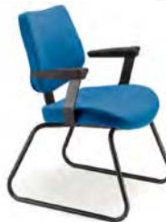
4001 T A : 20" C : 17 1/2" E : 15"