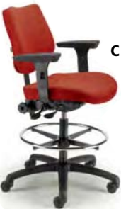
4001 DSN A : 20" C : 24 1/2 - 34 1/2" E : 15"