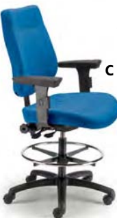
4002 DSN A : 20" C : 24 1/2 - 34 1/2" E : 19"