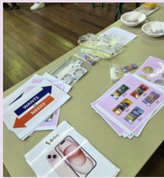
Junior Group's Money Management Workshop (2) held at Ashbury Senior Citizens Centre on 28/03/2026