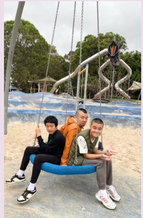
Easter Family Picnic at Fairfield Adventure Park on 04/04/2026, members enjoying each other's company with picnic food, games and fellowship!